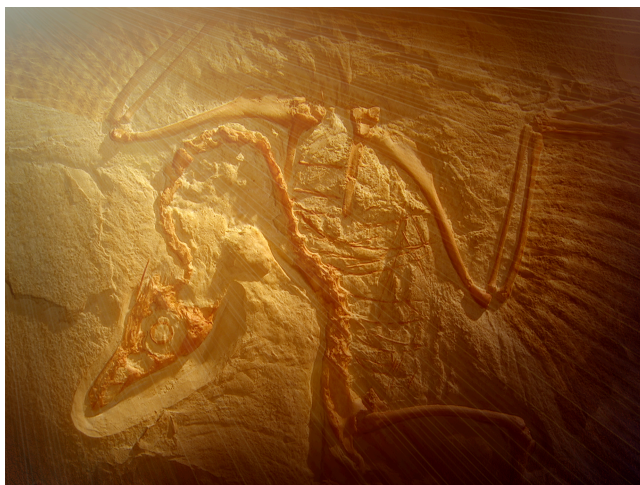
Figure 2. Archaeopteryx is considered the first true transitional fossil discovered. Although many fossils had been found in Darwin's time, none had features that were so obviously intermediate between two major groups of living animals.

The film Great Transitions: The Origin of Birds takes us on a journey to uncover the evidence for birds' evolutionary relationships. That evidence consists primarily of shared anatomical features, which are evidence of common ancestry, but it also includes similarities in behavior (i.e., nesting behavior) and physiology (i.e., thermoregulation). We'll see that while many bird traits are shared with all reptiles, some of their most striking features are shared only with dinosaurs.